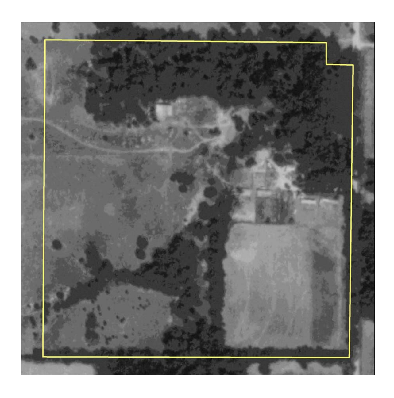
Figure 7. 1976 aerial image from the Blackjack Battlefield site.