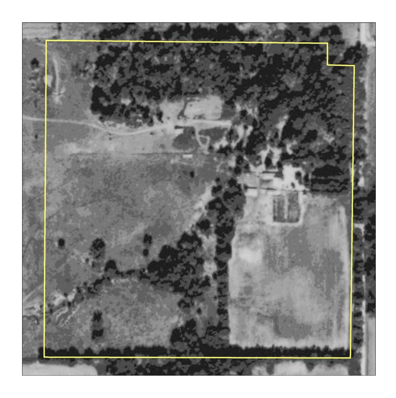
Figure 6. 1966 aerial image from the Blackjack Battlefield site.