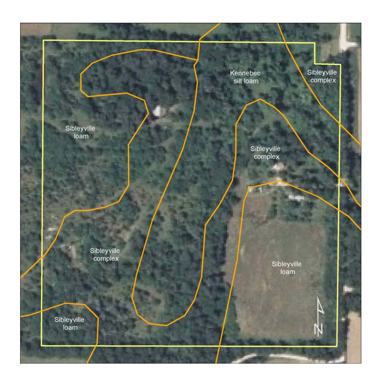
Figure 2. Soils of the Black Jack Battlefield Site.