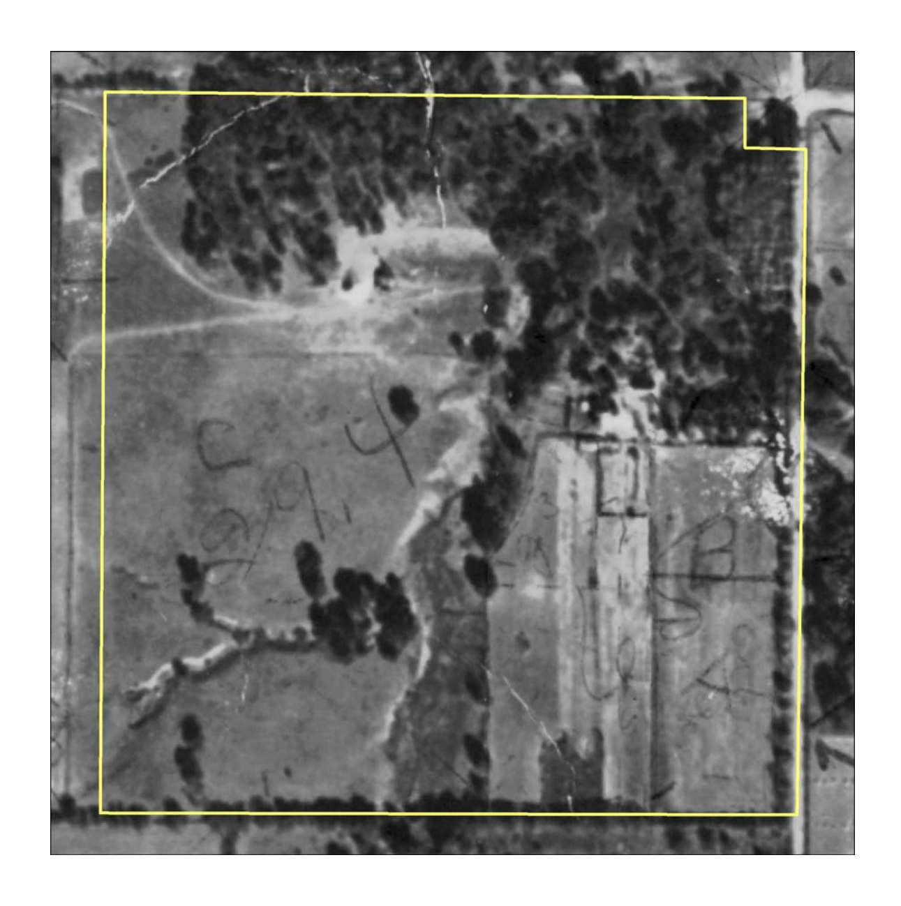
Figure 3. 1937 aerial image from the Blackjack Battlefield site.