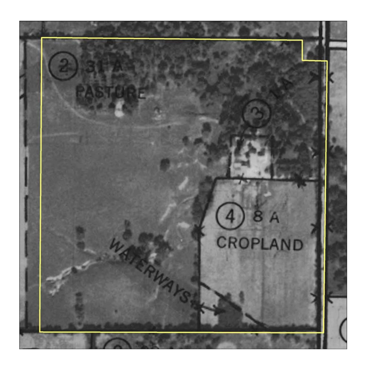
Figure 4. 1941 aerial image from the Blackjack Battlefield site.