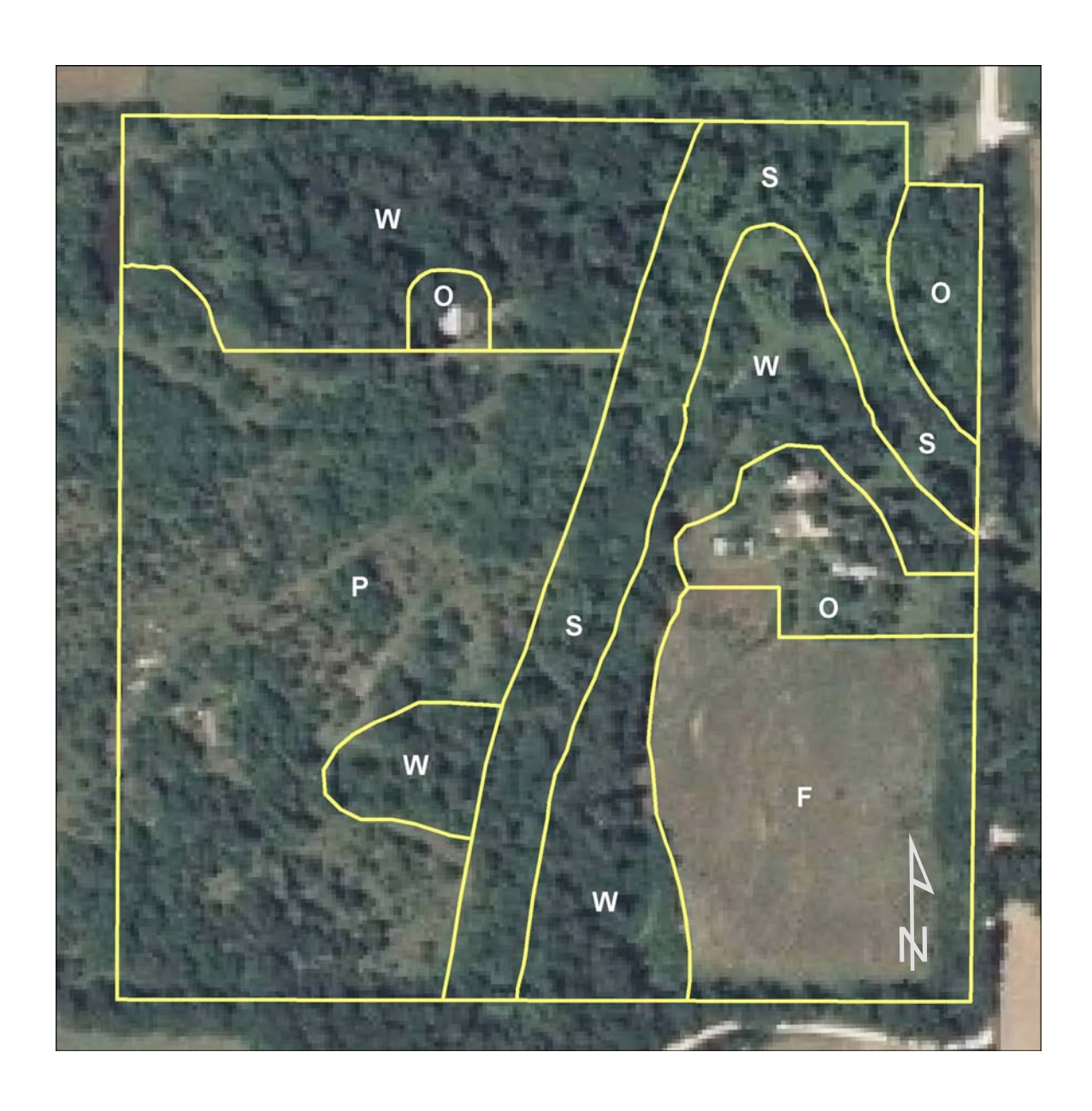
Figure 1. Management units at the Blackjack Battlefield site. S= Creek/Seeps/Wetland; F=Old Field; W=Woods or Forest; P=Prairie/pasture; O=Ornamental Plantings around structures or tree plantation. These units are also used for completing the plant species lists in Table 1.