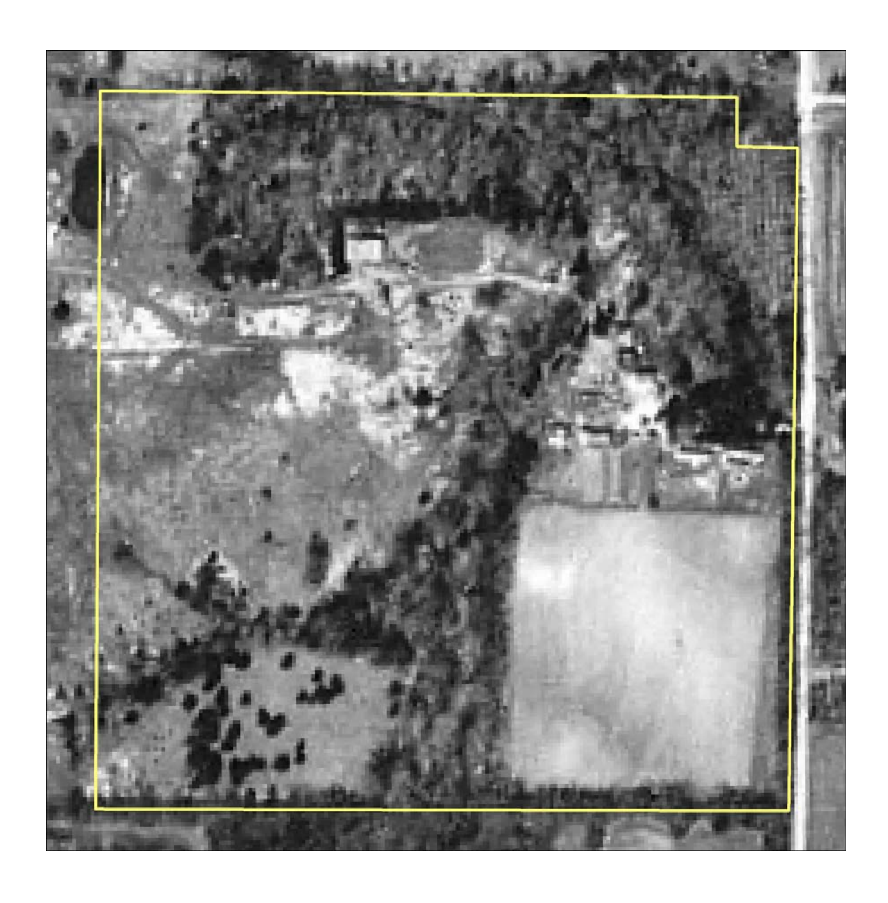
Figure 8. 1986 aerial image from the Blackjack Battlefield site.